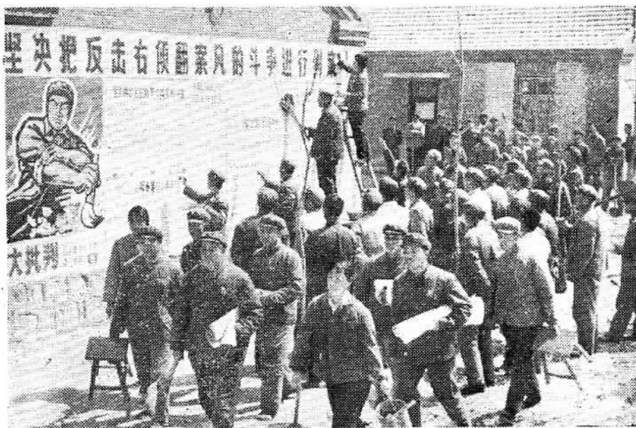
Putting up wall newspapers criticizing Teng Hsiao-ping and repulsing the Right deviationist wind.

Conditions today have improved enormously. Material achievements are of course considerable, but