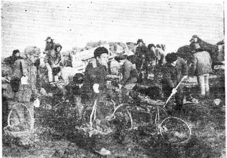
Taking part in physical labour.

Since China entered the period of socialist revolution in 1949, Chairman Mao has repeatedly put forward the question of educating the cadres. In 1966 he issued the famous May 7 Directive in which he called upon the people in all trades and professions to learn other things while engaging mainly in activities in their own fields, that is, to learn industrial and agricultural pro-