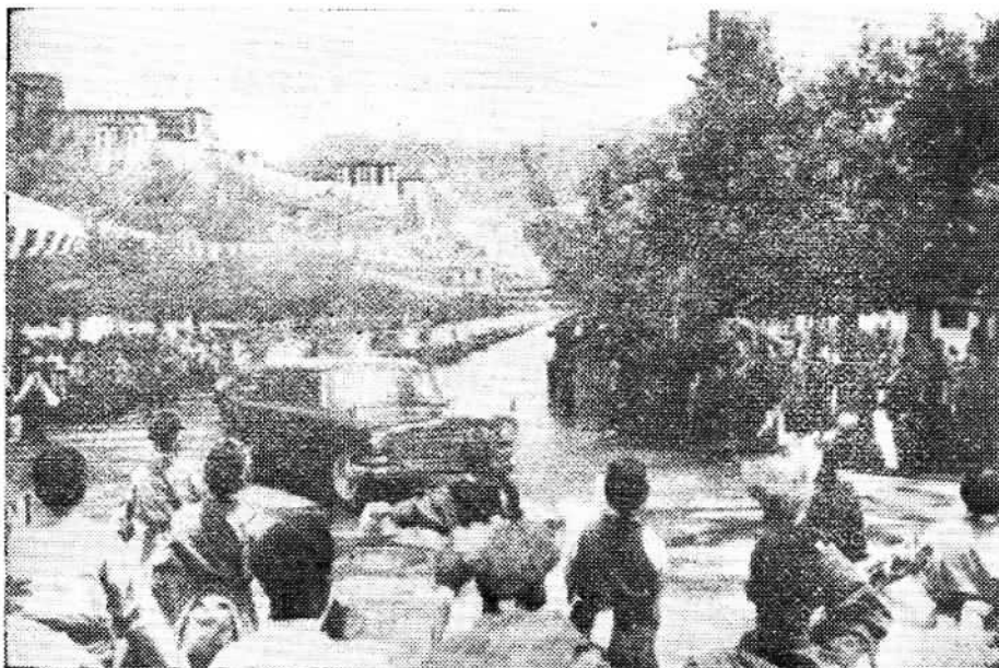
People lining the Lhasa street to give King Birendra a warm welcome.

common interest and achieved fully satisfactory results. Through the talks our mutual understanding has been further deepened and our friendship enhanced. The present visit by His Majesty the King has opened a new page in the friendly relations between China and Nepal.