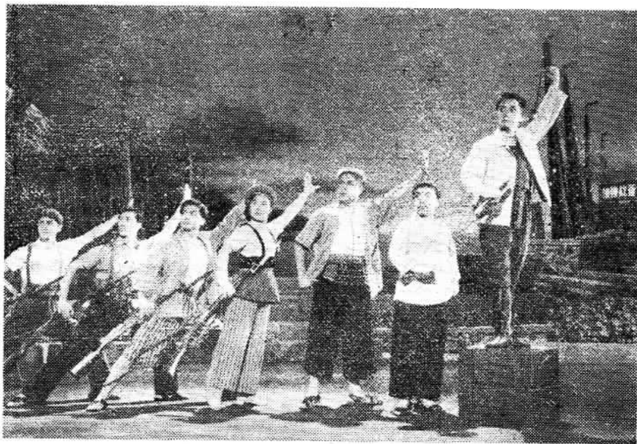
Another scene from Boulder Bay : The militia and the masses are determined to defend their motherland and wipe out the enemy completely.

He is a man with tact and good judgment. From the enemy movements on the sea and a sheath found in the village, he concludes that the sheath is the tally to be used by the hidden agent to make contact with the invading enemy. Using this sheath, he tactfully wins the confidence of the enemy agent sent ashore. When that enemy agent thinks he has found the man he wants and everything is going to be all right, he has actually confided to Lu every detail of the landing scheme.