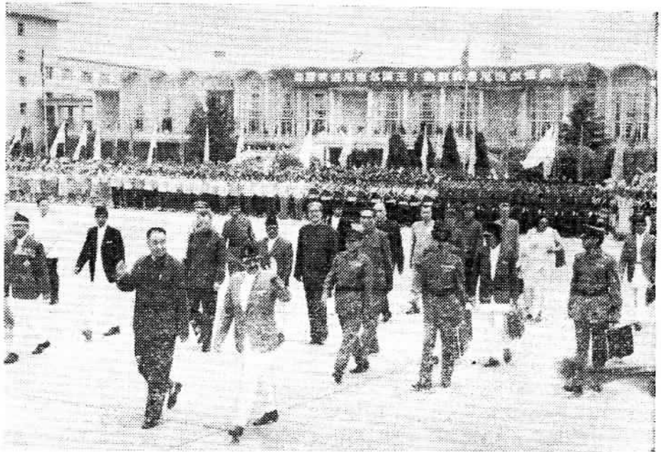
A rousing welcome for King Birendra at Chengtu Airport.

Welcoming the visitors at the airport were also leading members of the Szechuan Provincial Revolutionary Committee, the Chengtu Units