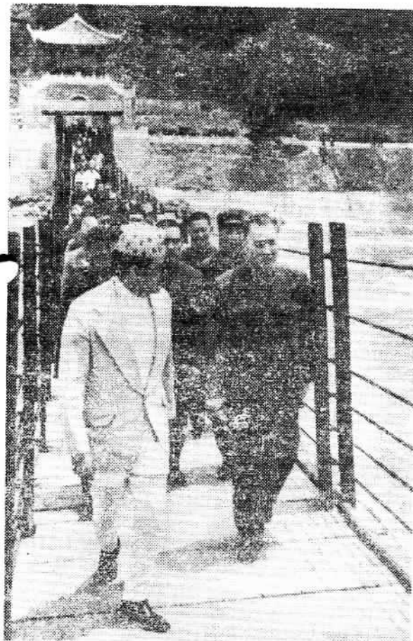
King Birendra visiting the Tuchiangyen Irrigation System.

of the Chinese People's Liberation Army, the Chengtu City Revolutionary Committee, as well as several thousand people in Chengtu.