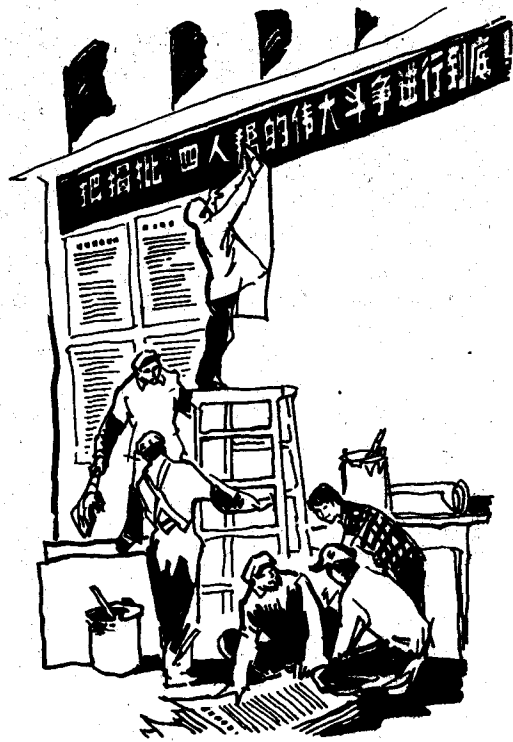
Workers putting up posters criticizing the "gang of four."