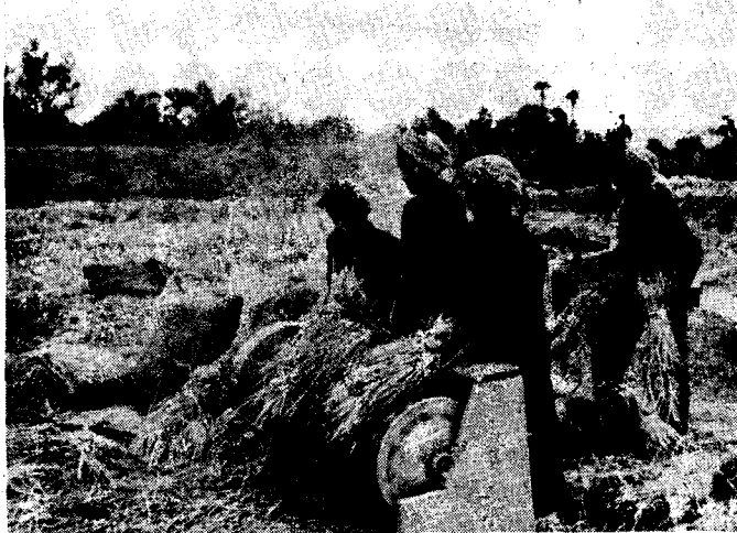
Agricultural co-op members at the threshing ground.

Attaching great importance to transforming the relations of production, the Communist Party of Kampuchea has vigorously unfolded a movement for agricultural co-operation. Agricultural co-operatives emerged in liberated areas as early as during the revolutionary war. Since the nationwide liberation, the agricultural co-operatives have grown both in number and scale. Co-operatives with 100 to 200 households have been expanded to include 700-1,000 households. The liberation of the productive forces has opened up broad prospects for agricultural development.