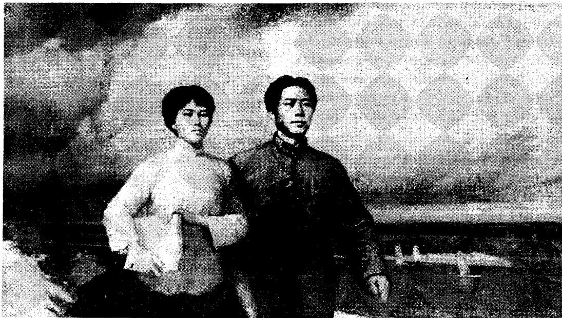
Chairman Mao and Comrade Yang Kai-hui.