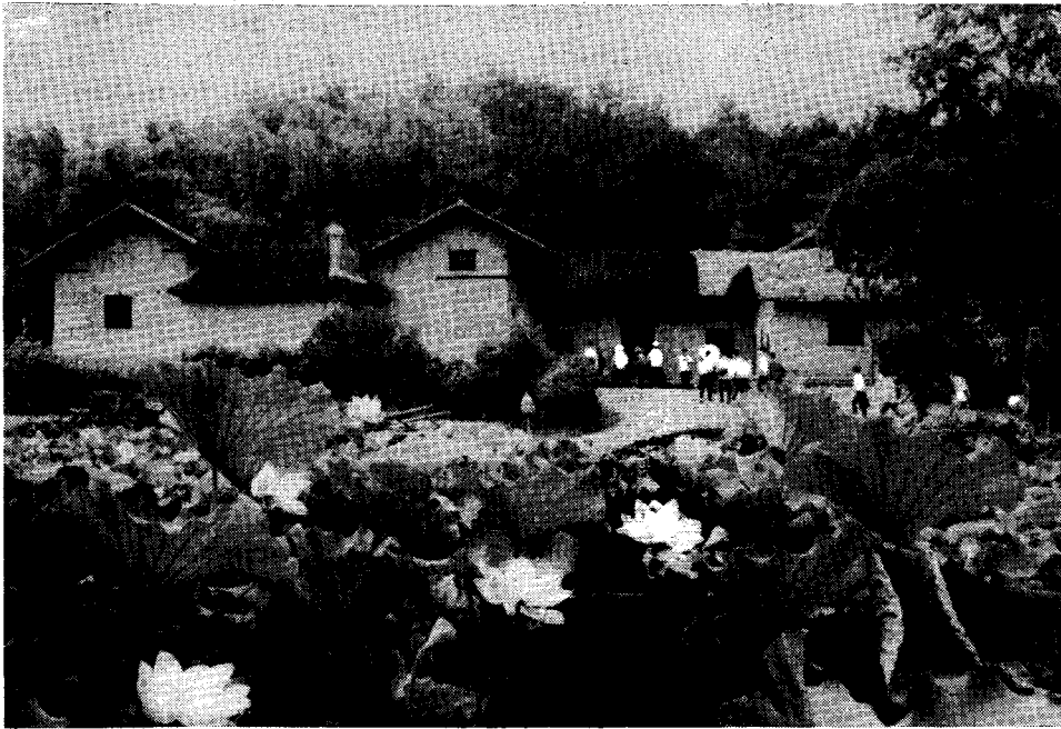
Chairman Mao's home in Shaoshan.

example for the Shaoshan people as well as for the whole country.