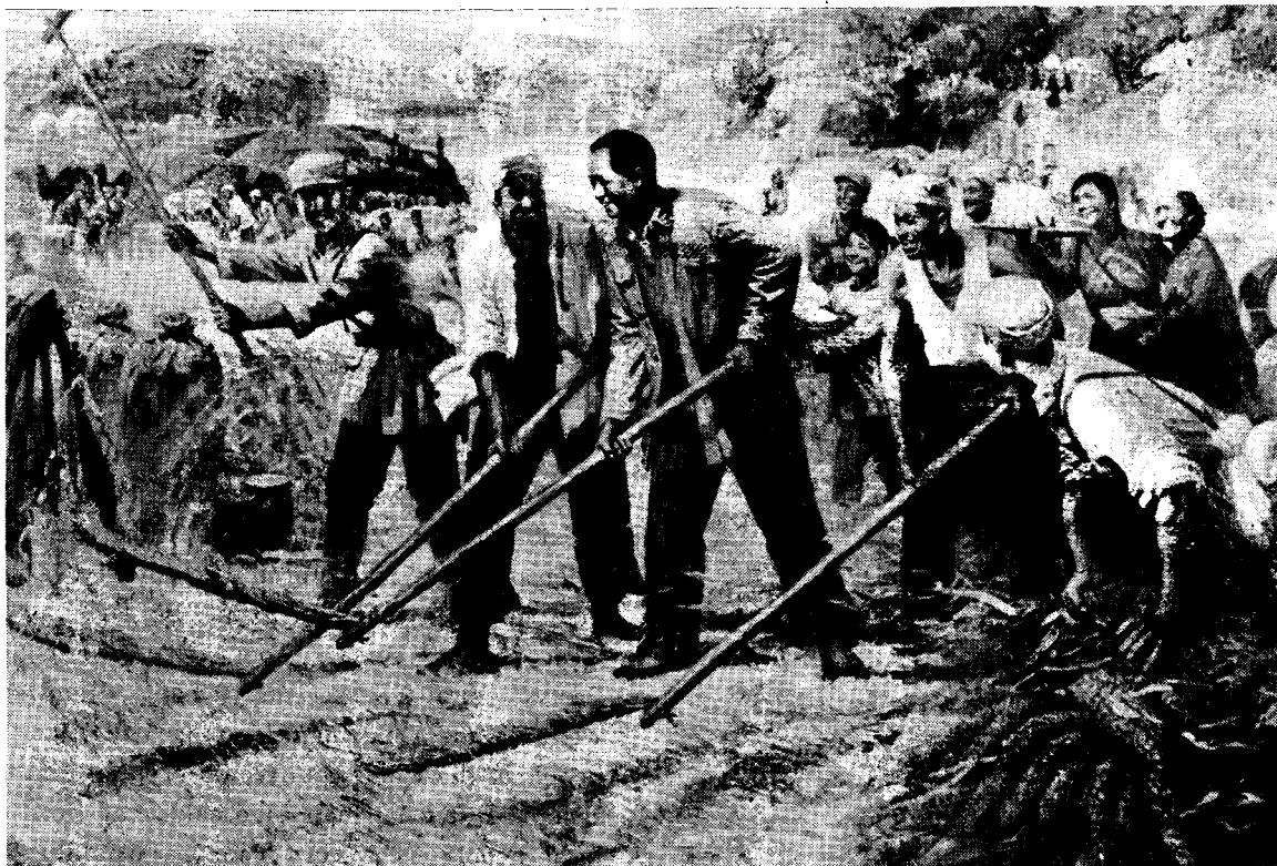
Chairman Mao working with the peasants in northern Shensi.