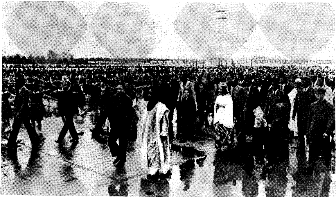
President Ahidjo, in the company of Chairman Hua, waving to the welcoming crowds at the airport.