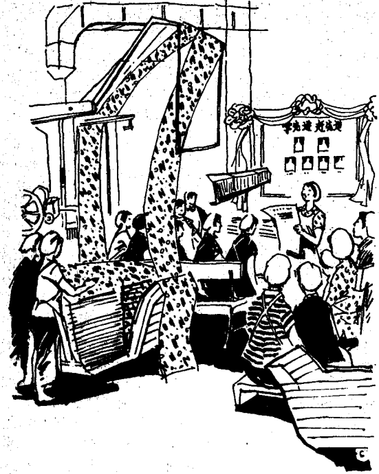
A political study session before work.

pointed out that "the struggle on the industrial front between the two classes, the two roads and the two lines is extremely fierce," adding that it was necessary to grasp "this principal contradiction," "to uphold the Party's basic line, criticize the revisionist line, capitalist tendencies and bourgeois factionalism and resolutely deal blows at the class enemy's sabotaging activities." In expounding Chairman Mao's three directives, it clearly pointed out "the necessity for placing primary importance on studying the theory of the dictatorship of the proletariat to promote stability and unity, and develop production." All this was written down in black and white. Could it be that the "gang of four" were blind and failed to see it? Not at all. They were just opposed to Chairman Mao's three directives.