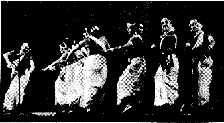
One performance by the Bangladesh Cultural Delegation.

is particularly memorable for its many powerful and splendid anaglyph-type stage poses.