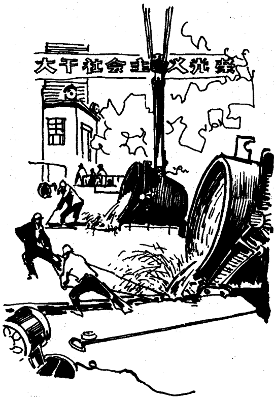
Banner over iron and steel plant: "Working hard for socialism is glorious."

Committee and the Fourth National People's Congress to accomplish the comprehensive modernization of agriculture, industry, national defence and science and technology within this century so that our national economy will rank among the most advanced in the world. It also pointed out that the question of the speed of industrial development is a sharp and weighty political question. This the "gang of four" attacked vehemently, saying that "The Twenty Points" dwelt "solely on modernization without mentioning revolutionization, on the development of the productive forces without mention of effecting changes in the relations of production and the superstructure," that such "modernization is a fake, and opposing revolutionization is the reality," that "in the name of accelerating industrial development, capitalist restoration is accelerated" and so forth. "The Twenty Points" dealt extensively with the need to uphold the Party's basic line, to strengthen Party leadership, to rely on the working class wholeheartedly and to implement the Charter of the Anshan