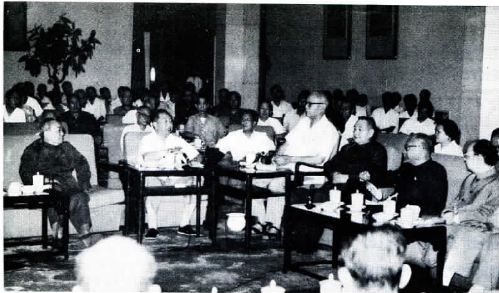
N.P.C. Standing Committee Chairman Ye Jianying and Premier Hua Guofeng join the deputies from Guangdong Province in their discussions.

series of important political, economic and organizational measures adopted, we have multiplied achievements on all fronts in the course of implementing the tasks defined at our last session.