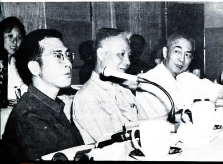
Deputy Cao Yu (first from left), a well-known playwright, at a group meeting.