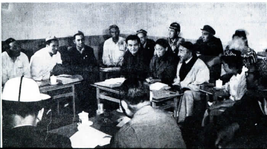
Left: Deputies from the Xinjiang Uygur Autonomous Region. Right: Banqen Erdini Quoigyi Gyancau (first from right), a member of the Standing Committee of the C.P.P.C.C. National Committee, speaks during a group discussion. Members of the C.P.P.C.C. National Committee attend the N.P.C. session.

Strengthening of our socialist democracy and socialist legal system is urgently needed for the sake of consolidating the socialist state system which is led by the working class and has as its masters the entire working people, for the sake of solidifying the political foundation on which the country can carry out socialist modernization in stability and unity, for the sake of bringing into full play the enthusiasm and initiative of our whole people in modernization and for the sake of ensuring that there are no further serious loopholes in our political system which can be taken advantage of by conspirators like Lin Biao and the gang of four in their attempts at counter-revolutionary restoration.