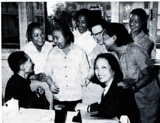
Ding Ling (third from left) with other noted writers and artists.

include her best novels, proses and commentaries.