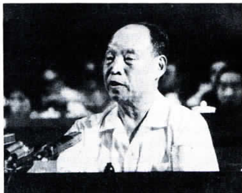
Peng Zhen speaking on the draft laws.

These draft laws, Peng Zhen pointed out, had been jointly worked out by the Commission of Legislative Affairs of the N.P.C. Standing Committee and other departments concerned after long and careful deliberation. China