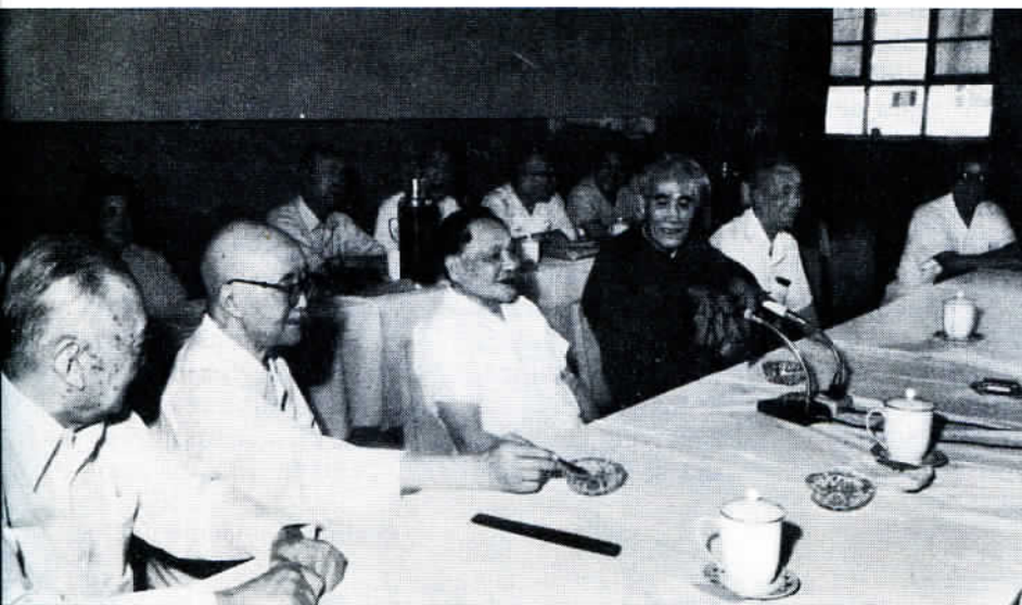
Vice-Premier Deng Xiaoping with deputies from Sichuan Province.

and technology among scientists and technicians and among the youth and other people all over the country, and this has yielded initial results. The reform of our enrolment system for institutions of higher education and the criticism of the "two appraisals" concerning our work in education during the 17 years prior to the Cultural Revolution have promoted an overall consolidation of educational work,