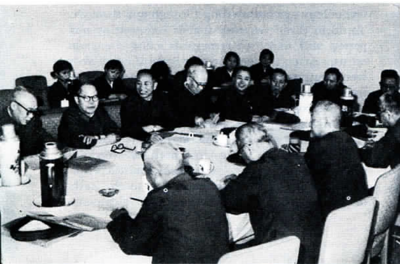
Deputies from the People's Liberation Army.