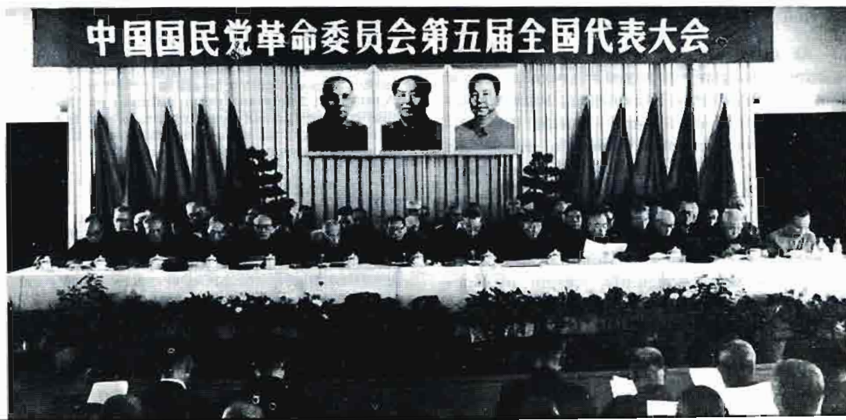
The National Congress of the Revolutionary Committee of the Kuomintang held in mid-October this year.

The original social base of these parties consisted mainly of the national bourgeoisie, urban upper petty-bourgeoisie and their intellectuals, as well as some of the patriotic personages. Back in the periods of the War of Resistance Against Japan (1937-45) and the War of Liberation (1946-49), they took an active part in the resistance movement against Japanese aggression and struggles for democracy. On May 1, 1948, the Chinese Communist Party called for the convocation of a new political consultative