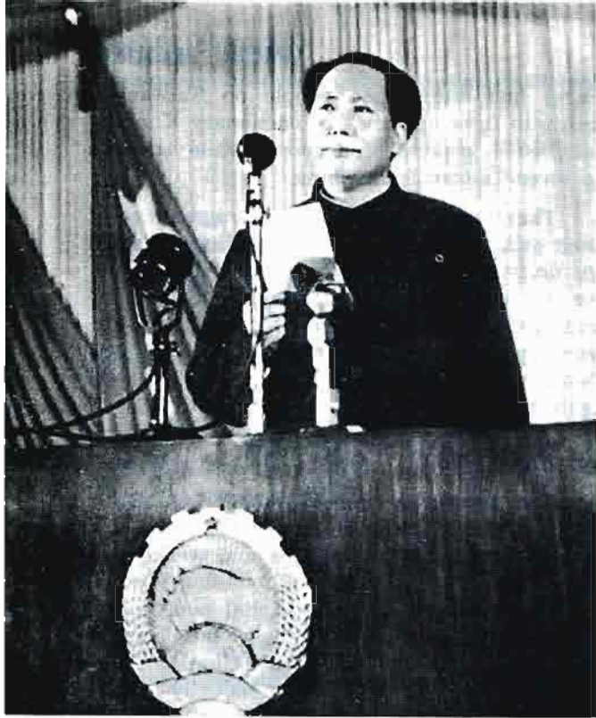
Chairman Mao in 1949 addressing the First Plenary Session of the C.P.P.C.C.

drawing up the Common Programme, a programme representing the goal of struggle and policies to be abided by various Chinese political parties, people's organizations and people of all nationalities within a certain period. It was also the political basis for unity of action.