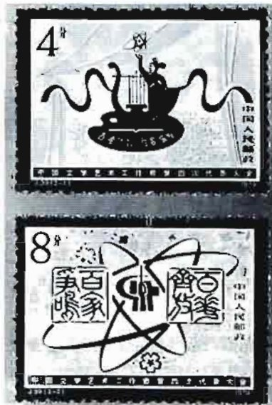
Stamps commemorating the congress.

corruption, but bow down to the bourgeois culture and ideas of the West to the extent of losing our own national self-confidence and self-respect, then that would be dangerous. We must be on our guard; we must oppose self-assertion and also belittling ourselves.