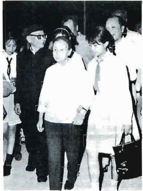
Xie Bingxin, noted woman writer and vice-chairman of the Association for Promoting Democracy, and Mao Yisheng, well-known bridge engineer and vice-chairman of Jiu San Society.

Delegates of the medical circles swapping experiences with one another at the Eighth National Congress of the Chinese Peasants' and Workers' Democratic Party.