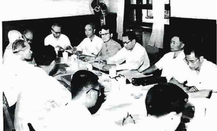
Delegates of the Taiwan Democratic Self-Government League at a small group discussion at the Second Session of the C.P.P.C.C. Fifth National Committee.