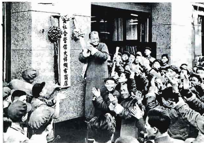
Businessmen celebrating a state-private merger during the socialist transformation in the mid-1950s.

"The people and their government have no reason to reject anyone or deny him the opportunity of making a living and rendering