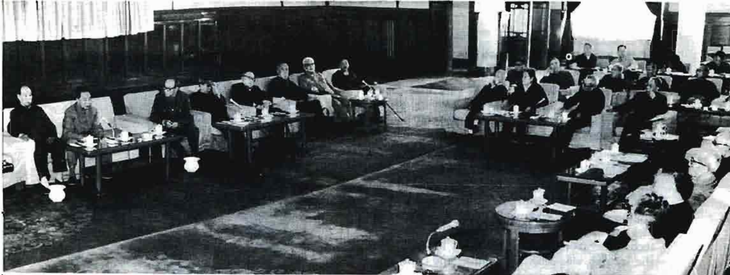
Chairman Hua speaking at a forum called by the C.P.P.C.C. and attended by democratic party leaders and non-party personages.

political questions, about once every two months. Chairman Hua Guofeng and other leaders of the C.P.C. Central Committee not long ago consulted with them about the adjustment of purchasing and selling prices for some farm products and two other problems relating to the national economy and people's livelihood. Similar consultations had been held in some provinces and cities.