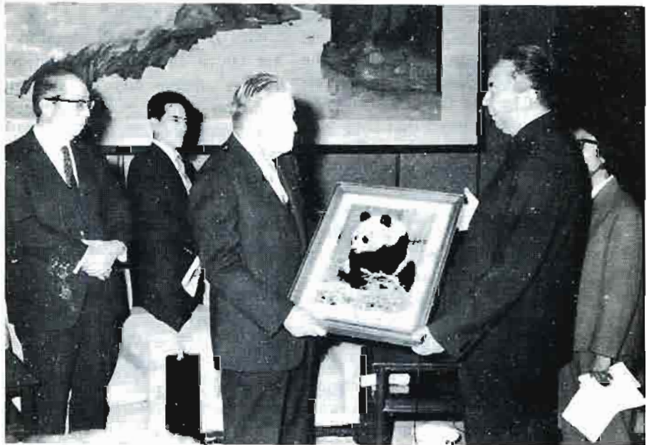
Premier Hua presents Prime Minister Ohira with a photograph of the giant panda Huan Huan which will be sent to Japan as a gift.

Economic and Cultural Co-operation. In the field of economic co-operation, the Japanese Government declared its intention to co-operate to the extent possible in the Shijiusuo Port Construction Project, the Yanzhou-Shijiusuo Railway Construction Project, the Beijing-Qinhuangdao Railway Expansion Project, the Guangzhou-Hengyang Railway Expansion