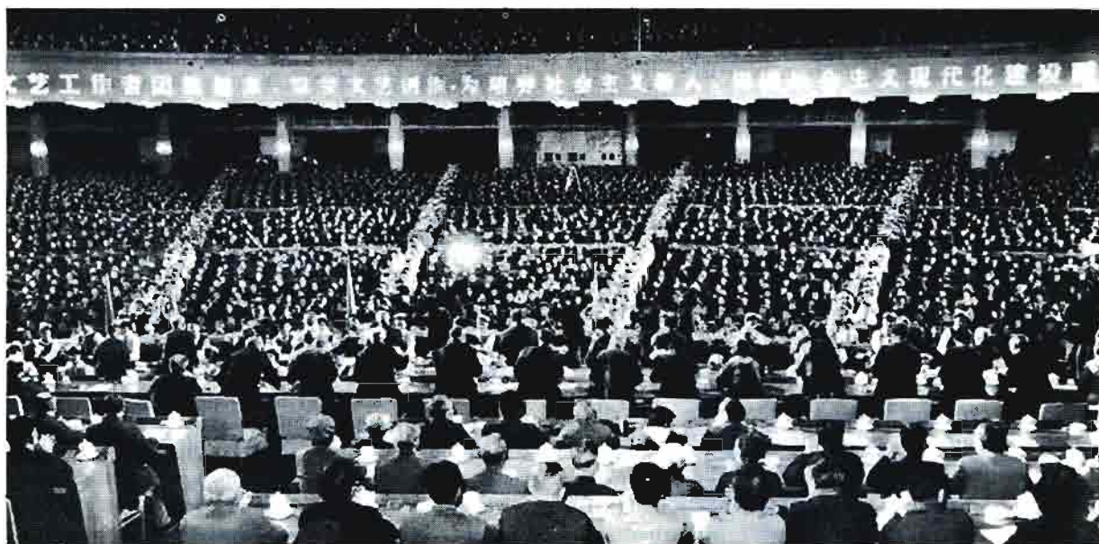
At the closing session of the Fourth National Congress of Chinese Writers and Artists.

What, then, are the main experience and lessons? To put it in a nutshell, we need to correctly handle the following three relations: (1) the relation between literature and art on the one hand and politics on the other, including the question of how the Party should exercise leadership over literature and art; (2) the relation between literature and art on the one hand and the life of the people on the other (when it is expressed in actual works of literature and art, it becomes the question of realism in creative works); (3) the relation between inheriting the traditions of our literature and art and making new advances, or, in other words, the question of how to put into effect the policy of weeding through the old to bring forth the