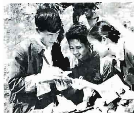
A Yunnan geological prospecting team which discovered a large phosphorus deposit.

Large-scale construction of the Kungang Phosphorus Mine is in full swing in Yunnan Province. It contains several thousand million tons of high-grade phosphorus ore in an area of 40 square kilometres. Partial extraction is presently done at the mine and more than one million tons of ore is being produced every year. It is one of the three largest phosphorus mines in China and will become the largest when construction is completed.