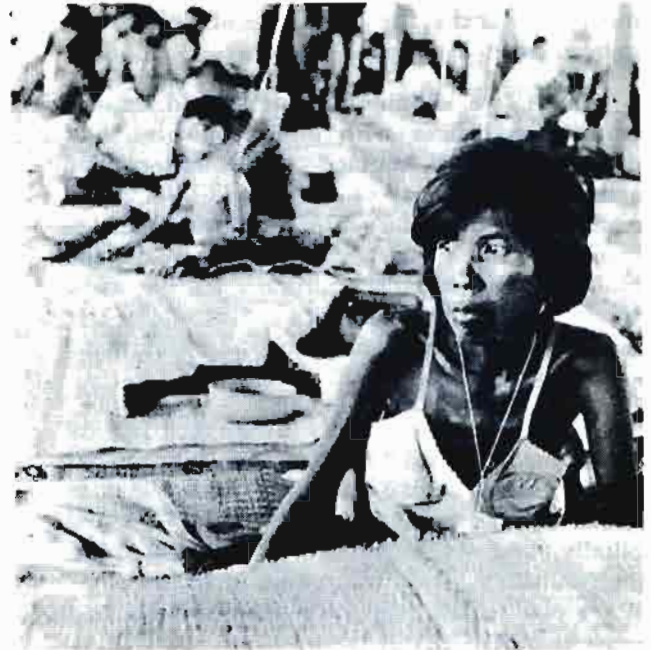
The sick and dying at the Sakaew Refugee Centre.

malaria despite the efforts of Thai doctors and nurses as well as medical personnel from other parts of the world. Twenty-five per cent of the refugees at the centre, or over 6,000 people, are ill, 960 of them seriously.