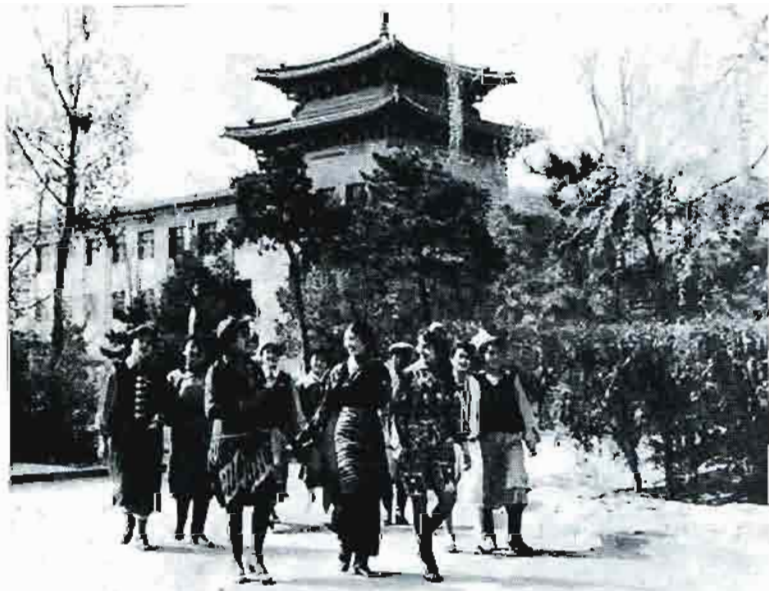
Minority nationality students in Beijing's Central Institute for Nationalities.

President of the Federal Executive Council of the Socialist Federal Republic of Yugoslavia Veselin Djuranovic