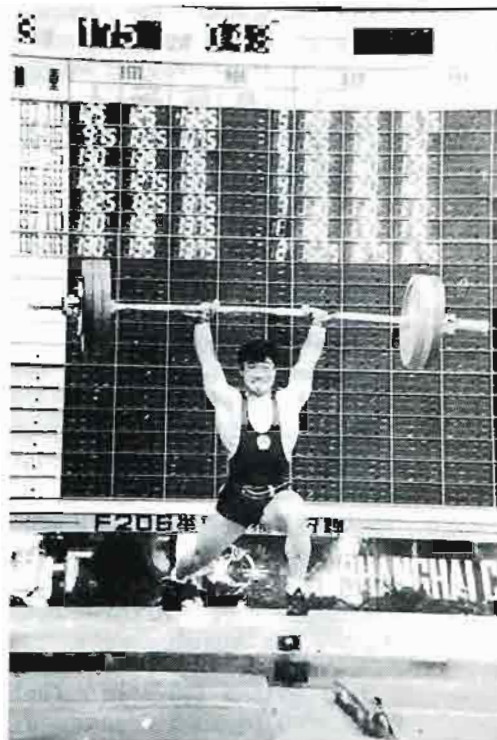
Chinese weightlifter Yao Jingyuan.

In the light-heavy weight (82.5 kg.) class and upward, the lifters of the United States dom-