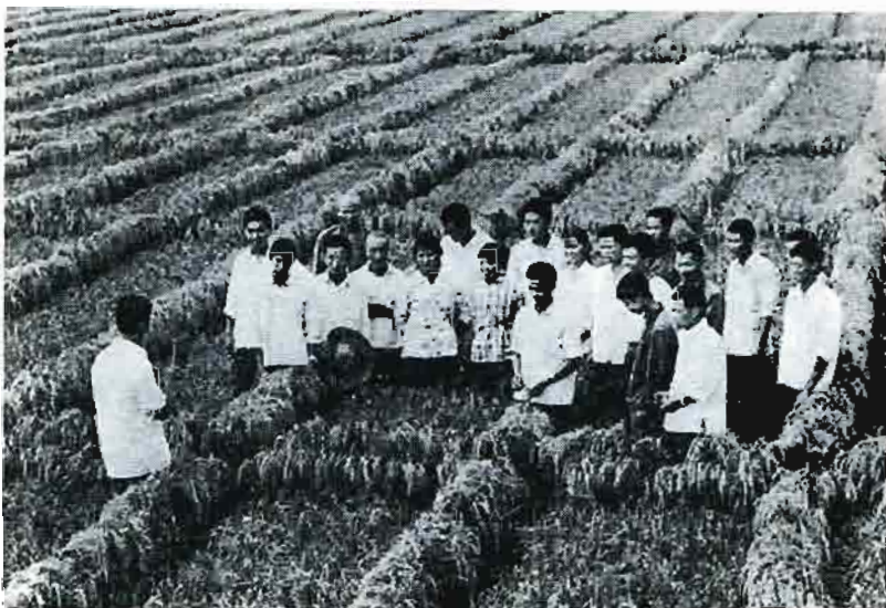
Students learn farming skills for hybrid rice at an agricultural technical school run by a rural people's commune in Sichuan Province.

The technical courses taught in the counties and local rural areas should mainly serve the various needs of the countryside. All trades and professions can