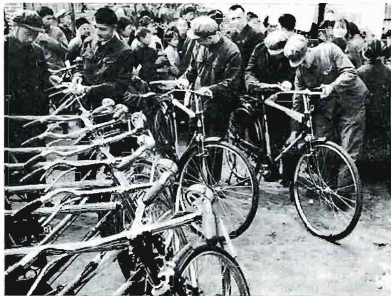
Bicycles on sale at a rural fair in Sichuan Province.

A ministry spokesman attributed this rise to the greater earnings for peasants from the diversification of the rural economy and the expansion of household sidelines. He further