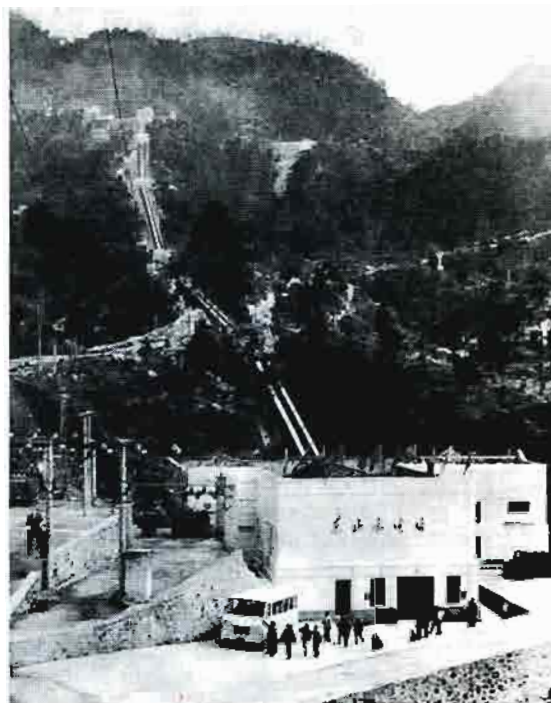
A small hydropower station built by a county in Guangxi Zhuang Autonomous Region.

International SHG Technical Centre To Be Set Up in China. Small hydropower generation (SHG) techniques are gaining