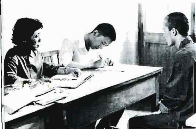
A woman lawyer talking to an accused (right).

Lawyers work in legal advisory offices, non-profit organizations which are led and supervised by the state judicial organs. The expenditures of the offices are covered by the state and their incomes are handed over to the state. □