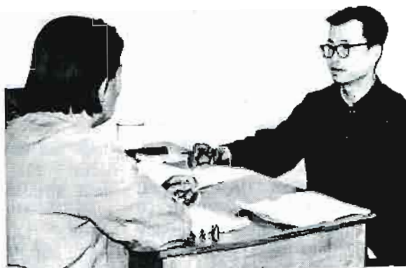
A lawyer (right) advising his client.

Thus, in a wider sense, lawyers are legal advisers to the public. They inform people about what is legal and illegal. These services often help people protect their legitimate rights