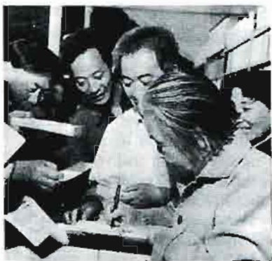
Ding Ling (1st from right) signing autographs for visitors.

The fair offered a comprehensive review of the work of China's publishing industry over the past few years. Between 1977 and 1979, China