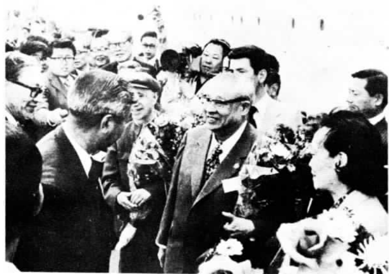
Liao Chengzhi (middle, front ground) leads the "China-Japan Friendship Ship" to Japan in May 1979.

He did excellent organizational work for the successful convocation of the 1952 Peace Conference of Asian and Pacific Region in Beijing. Here I want to mention in particular that Liao Chengzhi had done a great deal to create a situation for Chinese writers' international