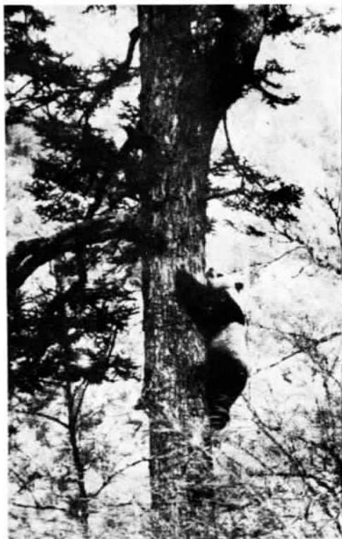
A giant panda in the Wolong natural reserve in Sichuan Province.

The survey group also tracked one male panda for 76 hours that weighed about 100 kilo-