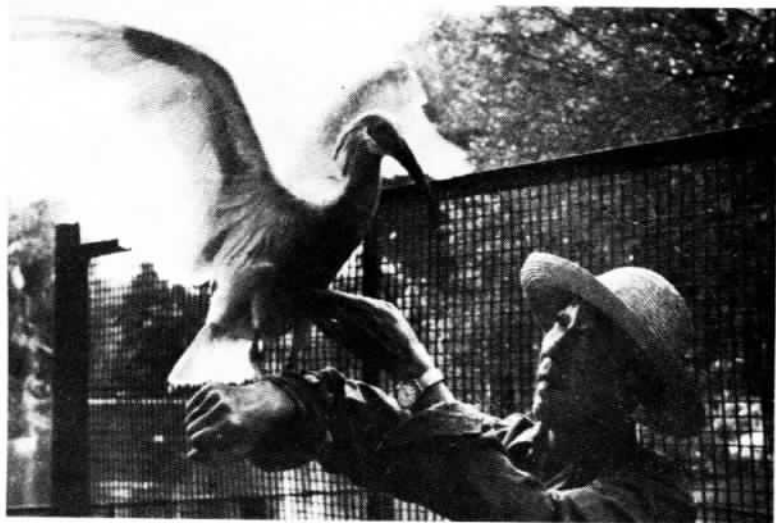
A rare crested ibis.

been set up in 20 provinces and autonomous regions.