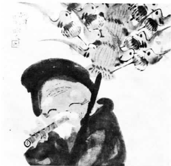
Sound of a Bamboo Flute Attracts Small Listeners.