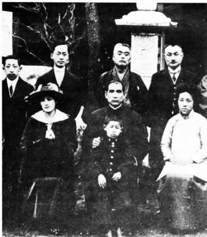
Liao Chengzhi (boy), Sun Yat-sen, Soong Ching Ling, Liao Zhongkai (first from left, back row) and He Xiangning (first from right, front row) in Tokyo in April 1916.

and Madame He Xiangning. They had brought up a good son to carry on their revolutionary