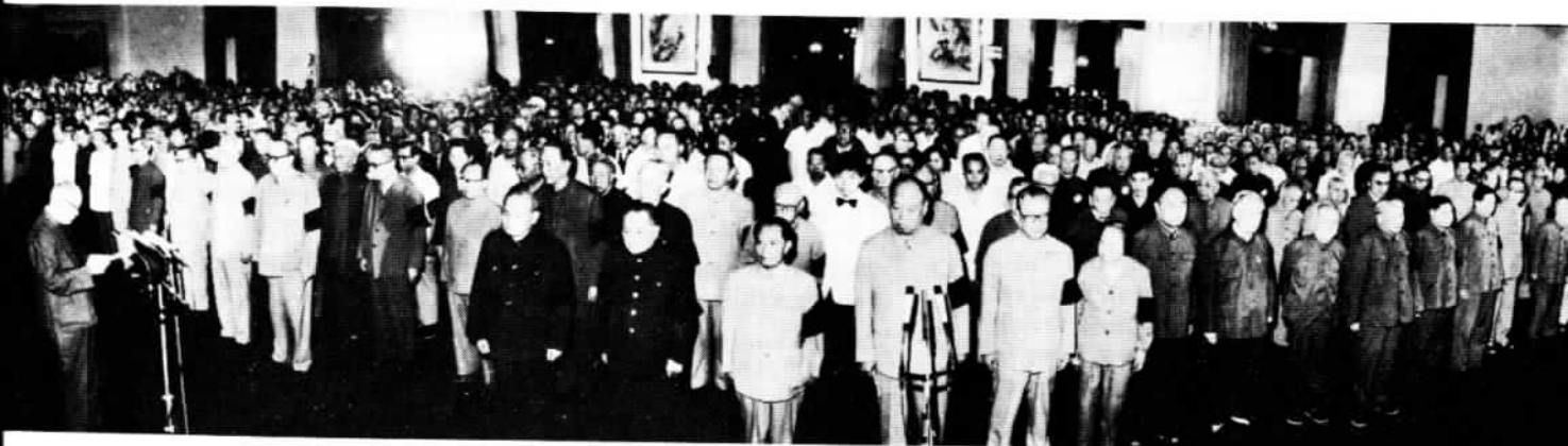
Party and state leaders as well as representatives from all walks of life at the memorial meeting for Liao Chengzhi.