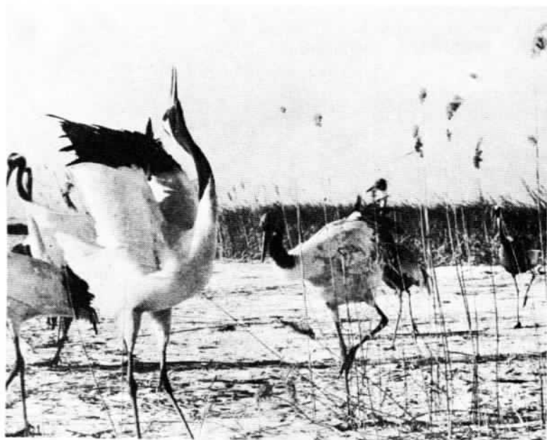
Red-crowned cranes in the Zhalong natural reserve, Heilongjiang Province.

As a consistent policy of the Chinese Government, the protection of wildlife has been given increasing attention. So far, 85 natural preserves have