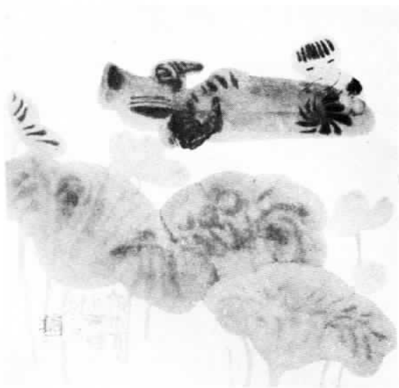
Lotus Leaves and a Buffalo.