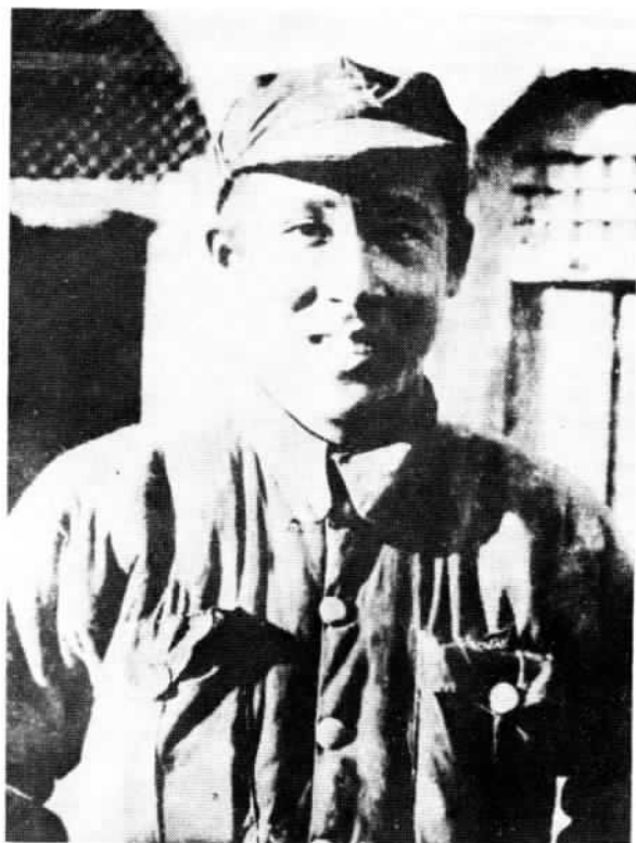
Liao Chengzhi arrives in northern Shaanxi in October 1935 after the Long March.

I began to work with him in 1937 after the War of Resistance Against Japan was launched. Without the energetic support from him and Madame He Xiangning, the newspaper for united front work among the progressive cultural workers, with Guo Moruo as its manager, could not have continued its publication in Guangzhou and Guilin.