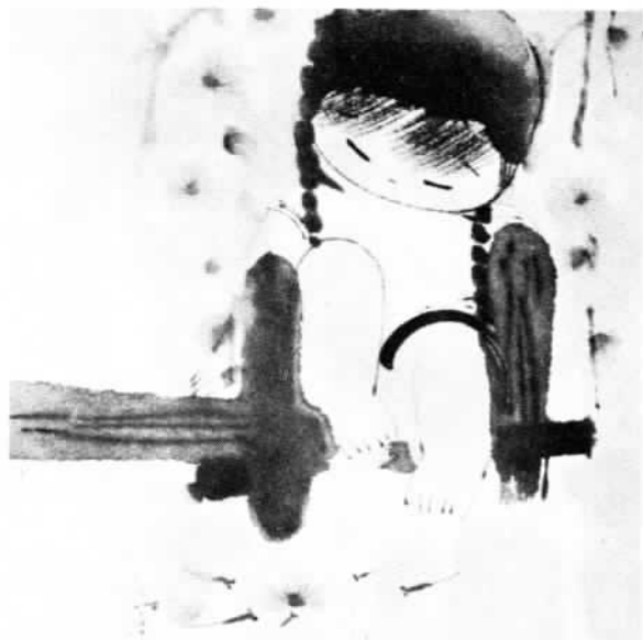
By a Brook.