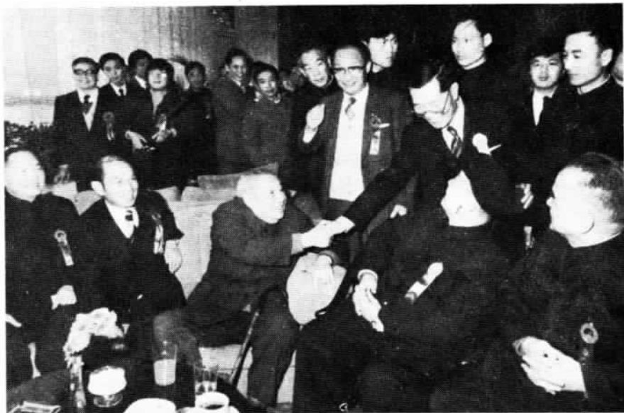
Liao Chengzhi meets noted Xianggang and Aomen personages in Guangzhou in February 1983.