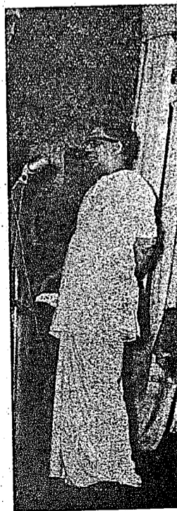
Rally after District Party Conference at Quilon being addressed by Comrade C. Achutha Menon. (Above) Procession before the rally.

SEE CENTRE PAGES FOR ARTICLE BY AJAY GHOSH