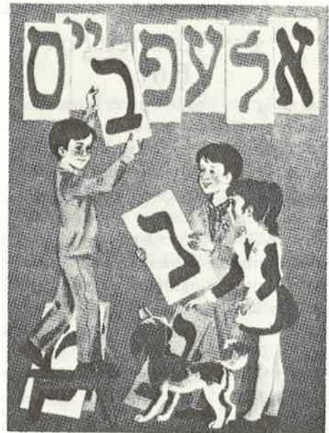
A Yiddish primer published in Khabarovsk in 1982.