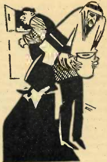
Profiteering Near the Ark of the Law

(The words "Ark of the Law" are rendered in mocking, scornful Ukrainian transliteration of the Yiddish expression, Oren Koy-desh.)