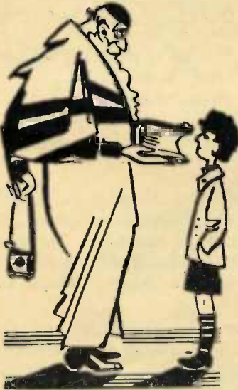
The Jewish Child-Buyers—Enemies of Youth

(The words "Ark of the Law" are rendered in mocking, scornful Ukrainian transliteration of the Yiddish expression, Oren Koy-desh.)