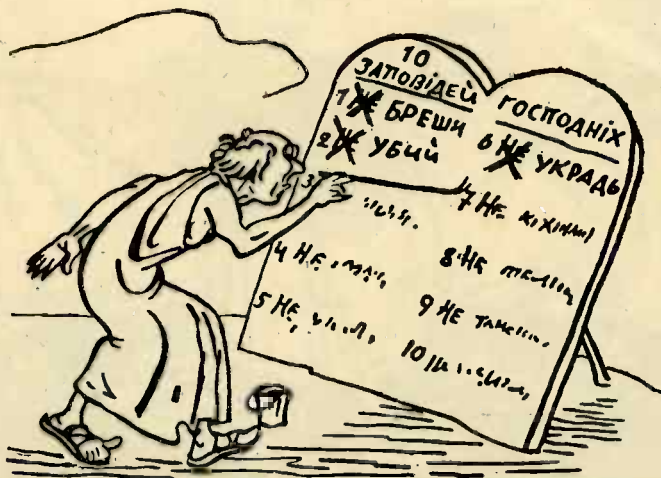
Ben Gurion At Work

"In the hands of the rabbis, these ideas are the chief spiritual weapon with whose help even today reactionary ideas are propagated, nationalistic