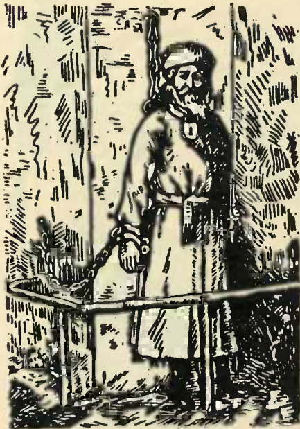
The Rabbis' Vengeance on Opponents

"Although the commandments of Judaism teach not to steal, nevertheless in many places of the Old Testament recommendations are made for the people to resort to common theft."