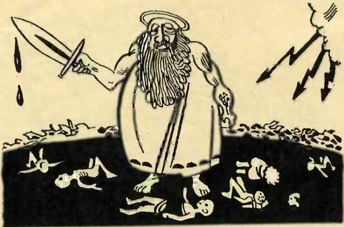
God destroyed all the first-born of Egypt

Pages 91-92—“The Jews like to talk a great deal about the Commandment which forbids them to bear false witness. However, when the