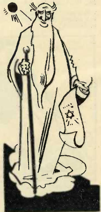
Their Heavenly Guardian Jehovah