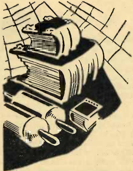
Torah and Talmud—The Webs of Obscurantism

(Caricature heading a chapter claiming that religious Jews ensnare youth into religion by offering bribes.)