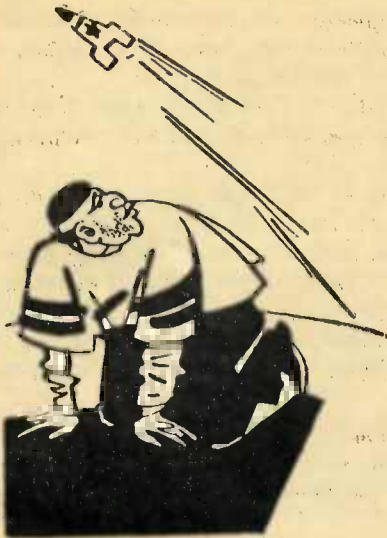
The Ensnaring Nets of Judaism Are Being Torn Up