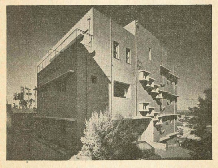
Hitadrut hospital in Haifa

Unbelievable as it may seem, in 1936 its budget exceeded that of the Health Department of the Palestine government. By the end of 1936 it embraced 70,000 members, who, with their families, composed no less than 35 per cent of the total Jewish population of Palestine.