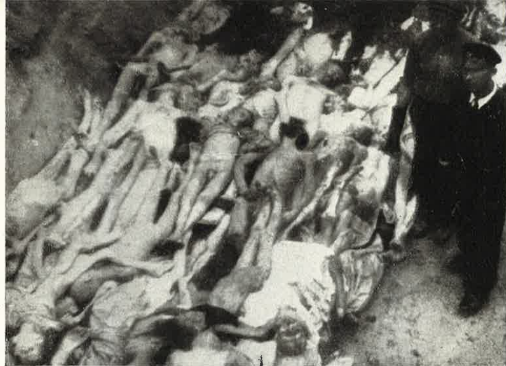
Not an illustration from Dante's "Inferno," but a real photograph of a mass grave of massacred Jews in Central Poland