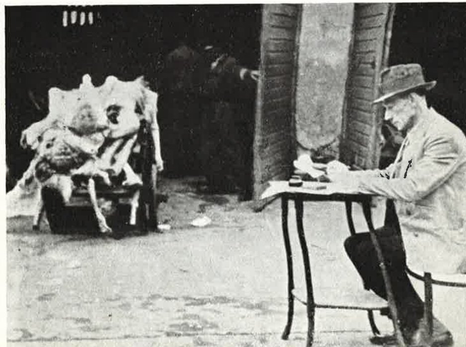
The tally of the dead

These facts prove that the crime-laden German Government is determined to bring to fulfilment Hitler's prophecy that, five minutes before the end of the war, whichever side may win, all the Jews in Poland will have been wiped out.