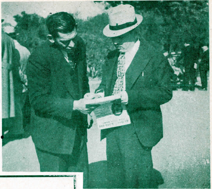
One of the 1,000,000 who signed the Herndon petition.

Already united action has been developed. A million signatures have