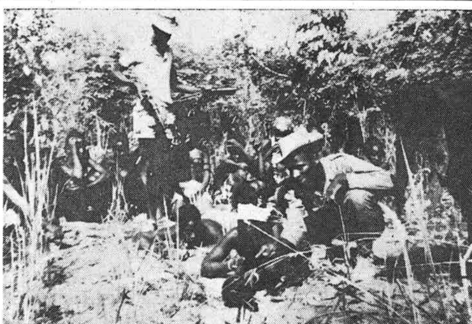
Women in Portuguese Guinea training to handle machine guns and other weapons

However, when the hired killers of the oppressor go on a binge of looting and sack a whole city, the New York Times gives it the innocuous headline of "Thefts Laid to Mercenaries" on page 14 a month after the event takes place!