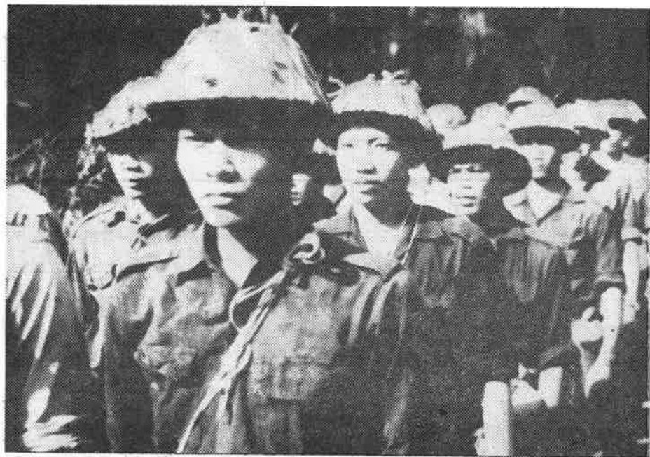
South Viet Liberation solders setting out to battle

Revolutions "such as that in South Vietnam" are sure to arise regardless of the present Soviet leaders or anyone else.